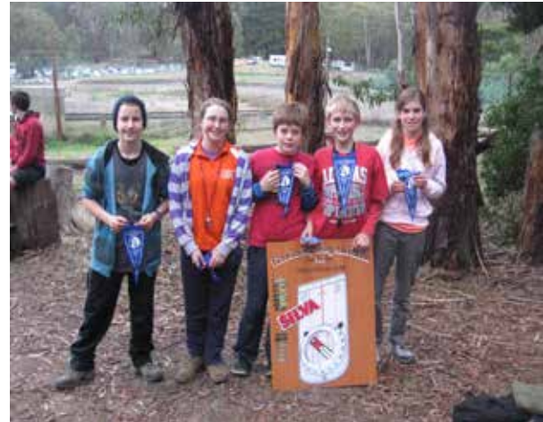
1st Gisborne Scouts IMG_0604.